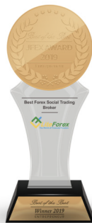
Best Forex Social Trading Broker