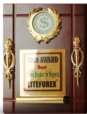
Best Forex Broker in Nigeria