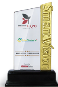
Best Retail Forex Broker

Team of this company is constantly developing and improving the platform, working on new services and keeping the already functioning one up to date. They always pay special attention to the development of technologies and the security of our clients' funds.